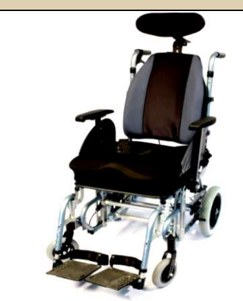
The images are purely indicative and may not reflect the standard configuration

◊= Standard o = Optional without up-charge \Box = Optional with up-charge If a selection is not made, the product will be delivered in its standard configuration